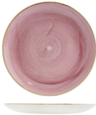
ROUND COUPE PLATE