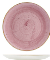
ROUND COUPE PLATE