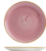
ROUND COUPE PLATE