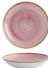
ROUND COUPE BOWL

Item No. Diameter Capacity 9975625-PK 248mm 1136ml